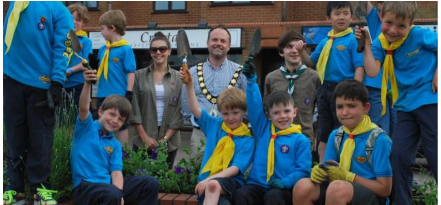
Meeting residents –both young and old- is a fantastic privilege

community spirit we have here in Amersham. This was also reflected at this year's Amersham Carnival & Town Show. Amersham in Bloom is also such an important part of our town and the volunteers are a huge credit. I very much hope that their determination and commitment to the initiative is rewarded when this year's Britain in Bloom results are announced.