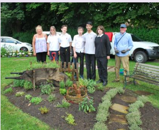
Stony Dean School were given a grant in 2015

Are you a member of a local community group, registered charity, sports club or voluntary sector organisation? Are you looking for financial assistance to deliver a particular project or initiative? If so then we would very much like to hear from you.