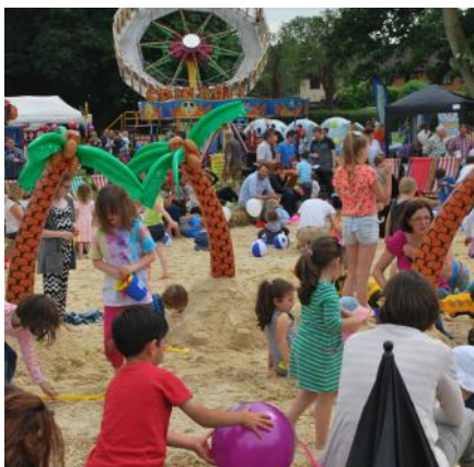
Amersham very own Copacabana Beach

Preparations are already being made for Amersham Carnival 2017. The Organising Committee would really value involvement from volunteers in the community and are actively seeking fun, exciting and pro-active individuals to join the team!