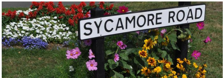
The floral displays at Sycamore Corner add colour and vibrancy to our town.

The town has really come together to embrace our entry into both the