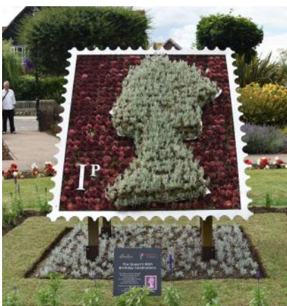
5000 plants were used to create the three structures in the Memorial Gardens