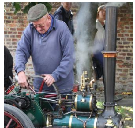
Mini steam engine rides prove very popular

The day will officially begin at 11.30am and finish at around 5.30pm. Other attractions include The Chesham All Girls Marching Band, Irish Dancing, an Amersham Band Quintet, Punch & Judy shows along with an appearance from our Honorary Town Crier. Why not come down on the day and enjoy a fantastic FREE family day out! The Council would like to thank the Kings Chapel and The Entertainer for their continued support of this community event.