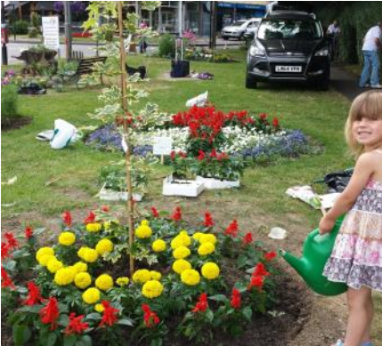
Volunteer numbers have increased by 100% over the past year.