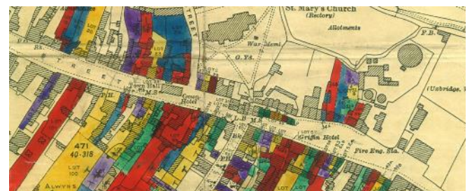
The grand auction map will be on display at Heritage Day

8. In what year did the family sell most of their Amersham houses in a grand auction ?