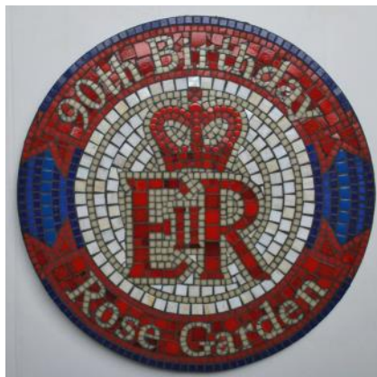
The Rose Garden mosaic is a wonderful addition to the Memorial Gardens

Designed by wonderfully gifted Andy Honour who was ably assisted by the 1 st Chesham Bois Scout Group Leaders we have constructed three 3-D structures that were subsequently planted by the Amersham in Bloom volunteers in conjunction with the Town Council. Over 5000 plants were planted individually to create these magnificent floral displays, which