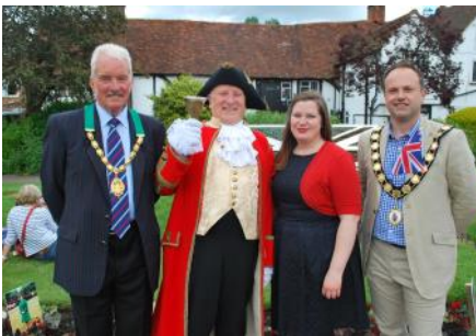
At the Queens goth Birthday Concert in June

Our Council is committed to putting the community at the fore-front of all we do and I have already had the opportunity to see this in action. The Queen's 90 th Birthday Concert in the Memorial Gardens was a fantastic success which highlighted the great