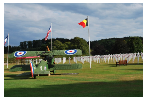
The Field of Remembrance commemorates the centenary of WWI and has relocated from Shardeloes (pictured)

the conflict. The crosses were constructed and painted by volunteers.