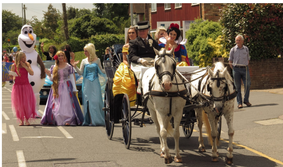
A fairy tale procession at last years Amersham Carnival and Town Show