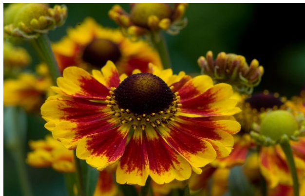
Heleniums and other perennials would add colour to the flowerbed

Herbaceous perennials provide essential food to bees and other