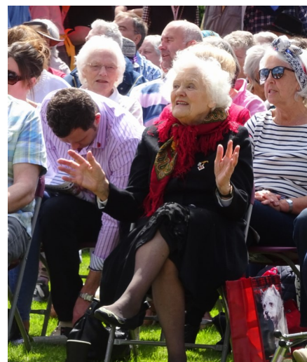
Enjoying the VE Day concert last May