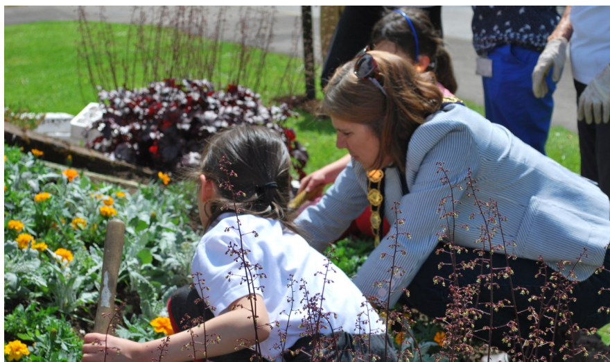
The Town Mayor helps plant a flowerbed that was designed by a school pupil