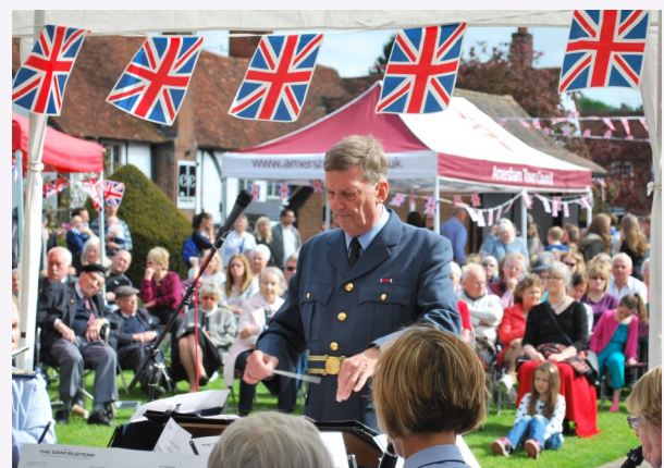
The Sunday afternoon band concerts are very popular

It promises to be a wonderfully British afternoon in the most beautiful surroundings of the Memorial Gardens.