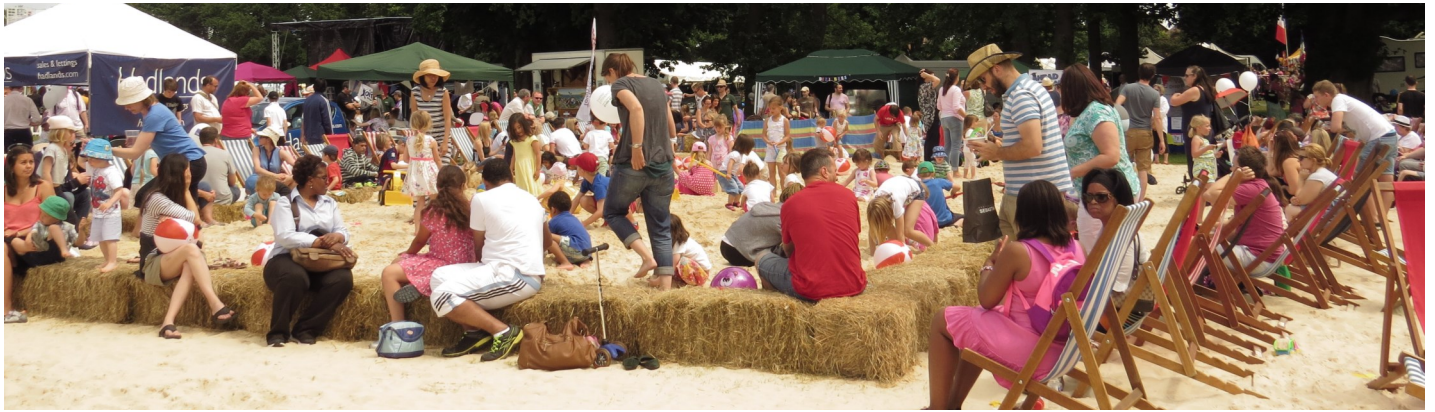
Amersham on the Sea will be back by popular demand