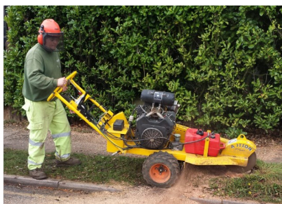
Working to improve Amersham

Devolved Services - The Depot team works in the Amersham community plus that of our neighbours in Little Chalfont, Gerrards Cross, Seer Green and Chenies. This work along with contract jobs helps general revenue.