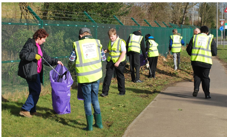
Stony Dean Pupils help out with Clean for the Queen

Since September the school has been instrumental in reducing litter in Amersham Common with over 20 pupils undertaking weekly litter picks, plus helping to Clean for the Queen in early March. Pupils also assisted in preparing the site at Willow Wood (Stanley Hill) prior to the planting of 420 native tree saplings.