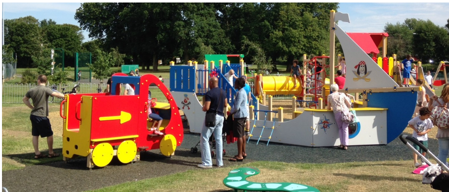
A wonderful addition to King George V Playing Field