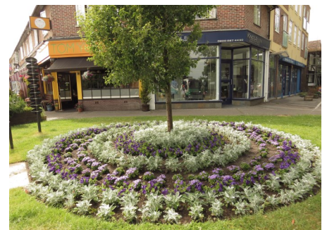
Volunteers and school children help to plant the beds throughout Amersham