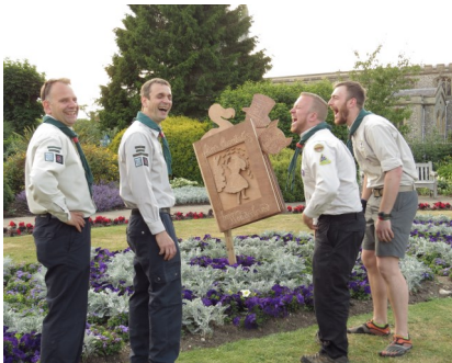
1st Chesham Bois Scout Leaders

Amersham also won two Thames and Chiltern in Bloom Regional Awards — one for conservation and wildlife and the other for the display in the Old Amersham Memorial Gardens .