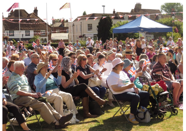
Lots of Union Jack flag waving