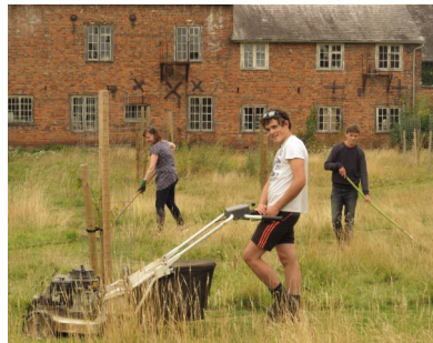
Pondwicks Orchard was highlighted as a great open space by the RHS judges

The group are proud to have received the award for the Memorial Gardens, demonstrating how working together as a community can achieve great results. The beds were designed by the bloom group, planted by the town council depot, maintained by the WI Amersham Angels, Bloom Group and Town Council Depot staff, sponsored by Van Hage while the wonderful wooden great event models were constructed by the 1st Chesham Bois Scout Group Leaders.