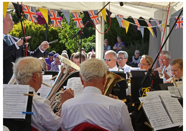
The Amersham Band