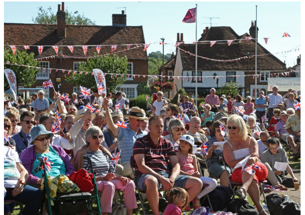
Crowds enjoy a sunny afternoon in the Memorial Gardens