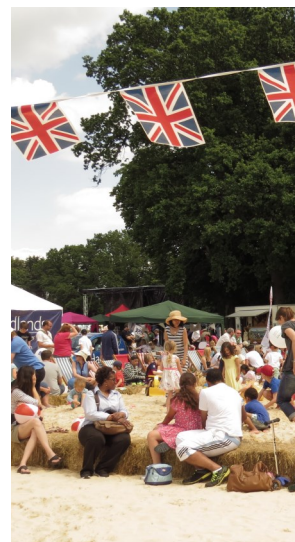
Amersham Carnival proved huge

The beautiful weather helped to ensure we had the biggest procession in recent Carnival history and everyone who participated, including local schools, community groups and businesses really embraced the Fairy-Tale theme.